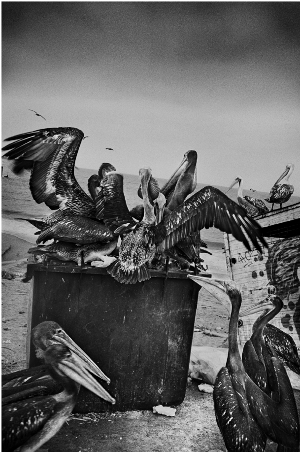
Tyghuset