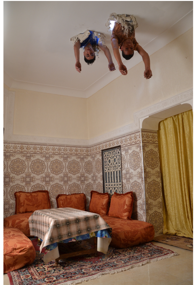
Holes. Kasernplan