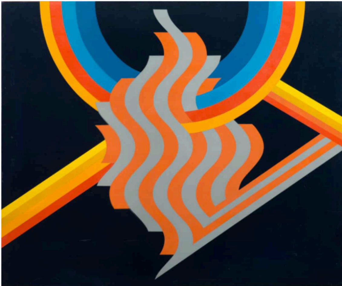
▲ Hard-edge painting... Untitled, 1975, by Mohamed Melehi.

His psychedelic paintings linked the Bauhaus to Islamic art - and brought the radicalism of the late 60s to Morocco. Now, at 82, the world is set to rediscover his vibrant visions