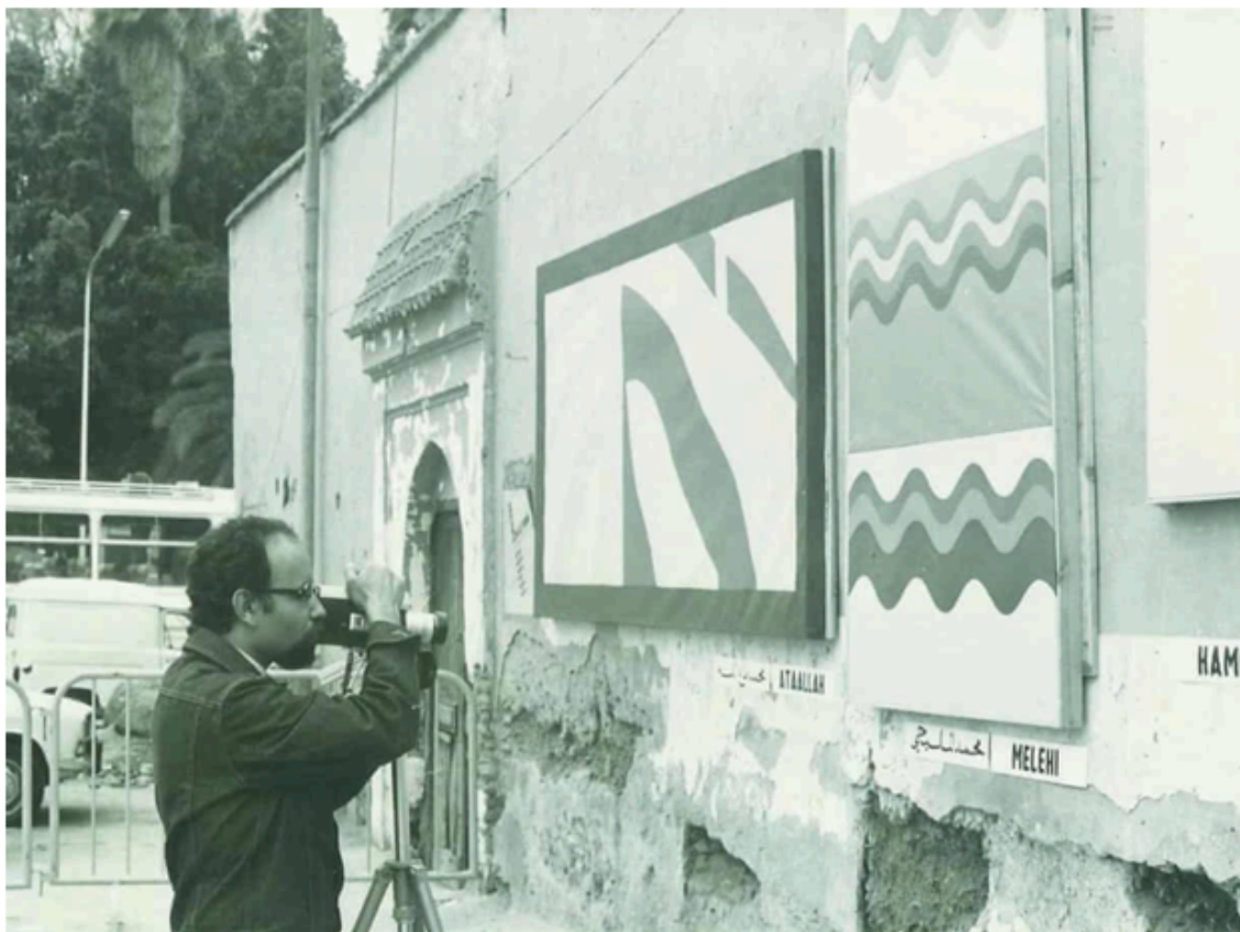
▲ Mohamed Melehi at the street exhibition in Jemaa-el-Fnaa square, Marrakech, in 1969.

"We took a position against the government," recalls Mohamed Melehi , one of the leading artists of the radical new group, now 82. "Our works were in Jemaa el-Fnaa square for a week, exposed to the sun and wind. It was an ideological message about what art could be."