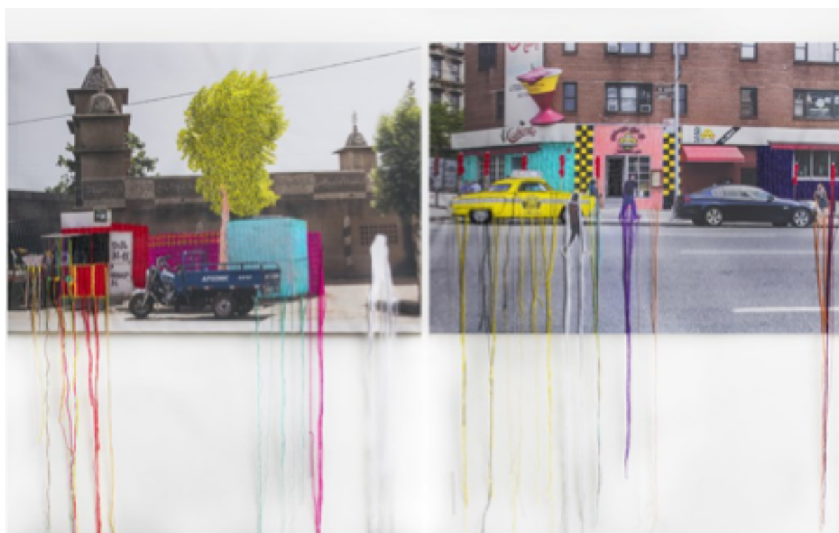
'Ouagadougou New York 2' from the series Translation, 2017

"She covers human stories. Her work is diverse. I don't want to call her a humanist photographer, but she uses facts as the basis for her work and creates interventions in places that have been traumatised. She goes back and documents her work to the people. I'm glad to see her get the recognition she deserves."