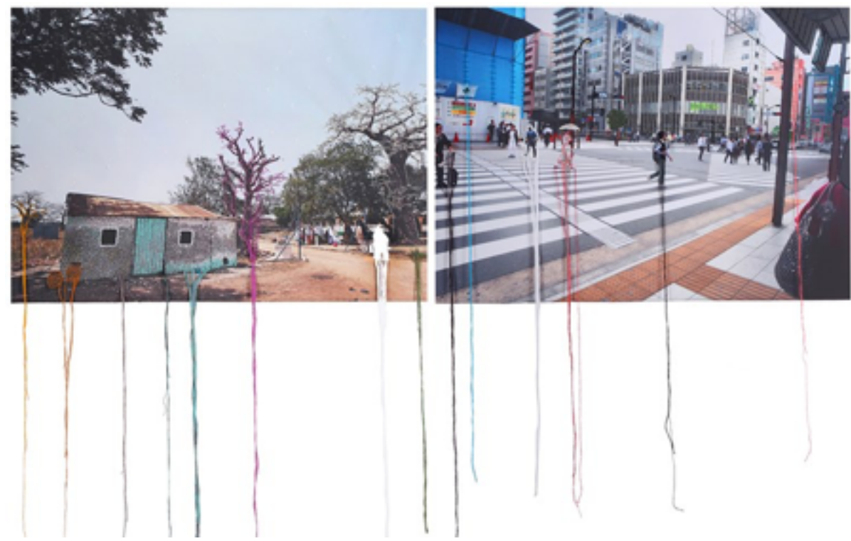
'Banjul Tokyo 2' from the series Translation, 2017