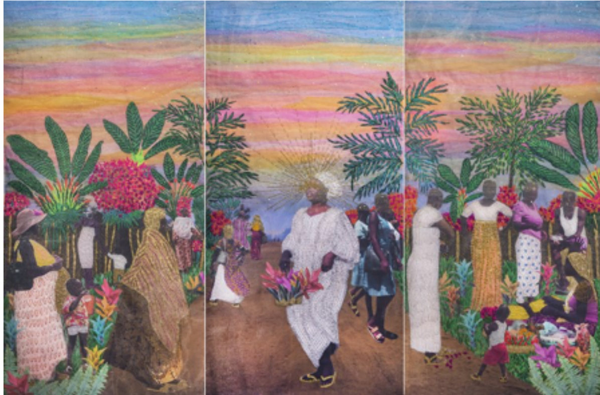
'Bromelia' from the series Albahian, 2021